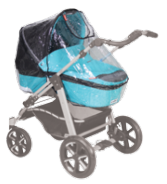
Rain cover (ERGO/AMIGO/VARIO/FIGO)