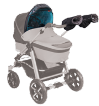
Winter accessory set (set of 2 items - AMIGO)