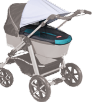
Summer accessory set (set of 3 items - AMIGO)