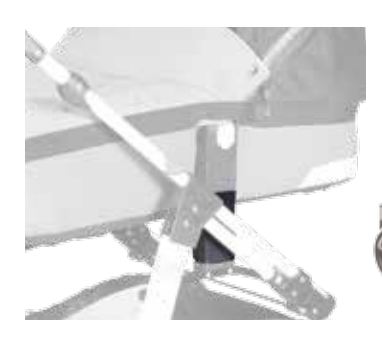
Carrycot height booster (AMIGO/FIGO)