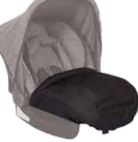
Summer foot-muff (MIMMO)