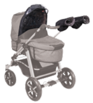
Winter accessory set (set of 2 items - FIGO)