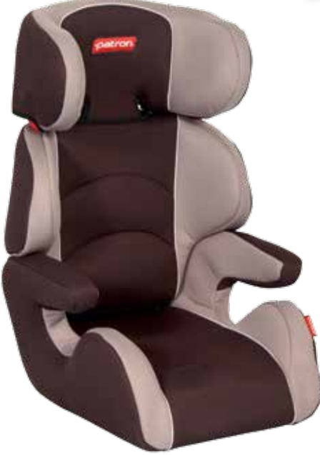
Bitter chocolate (734)