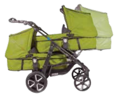
chassis with unique SPEX-function