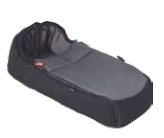
Winter baby nest (AMIGO/FIGO)