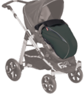
Winter foot-muff (ERGO) Winter foot-muff (VARIO)