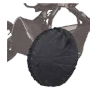
Tyre cover set 4R (uni) Tyre cover set 4X (uni)