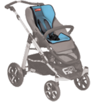
Seat inlay for small children (ERGO)