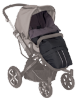
Winter combi foot-muff/ baby nest (uni)