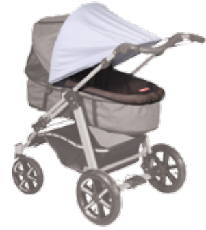
Summer accessory set (set of 2 items - FIGO)