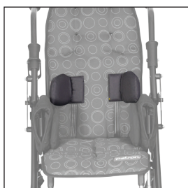
Side trunkrest CLASSIC