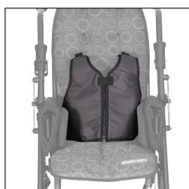
Immo. Waistcoat CLASSIC