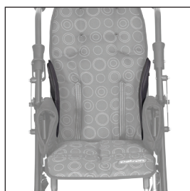
Hip rest CLASSIC