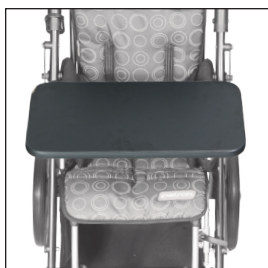
Work board BASIC - UNI