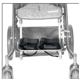
Feet fixation - pair