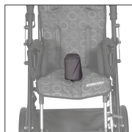
Abduction block CLASSIC