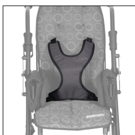
H-style harness CLASSIC