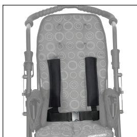
4-point immobilisation belt CLASSIC