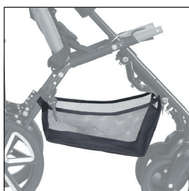
Basket - textile