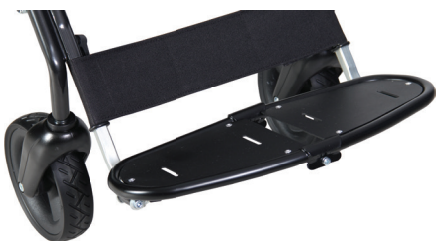
Standard 1-piece foldable footrests