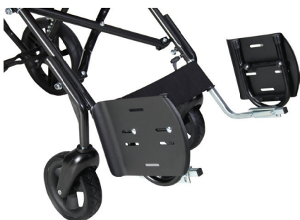
2-piece 3D-Flexi footrest option.