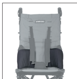
Comfort side protection