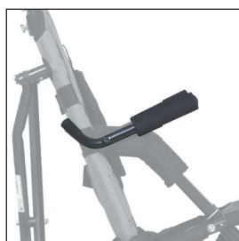
Armrest foldable (set)