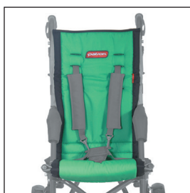
Comfort seat cover