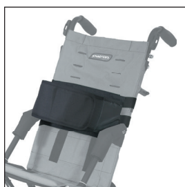
Chest immo. belt