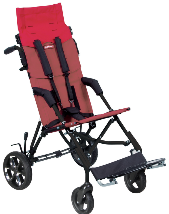
Backrest Height Extension (only size 38 and 42)