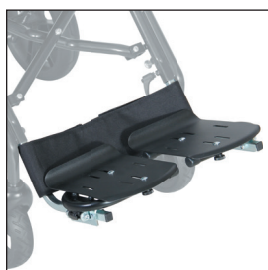
2-piece 3D-Flexi footrest