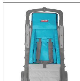
Seat inlay (seat size reduction)