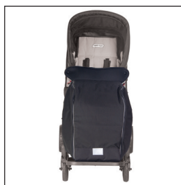
Footmuff - Winter