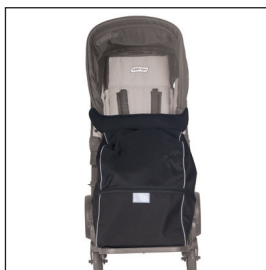
Footmuff - Summer